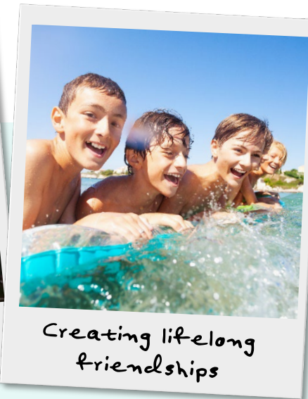
Creating lifelong friendships